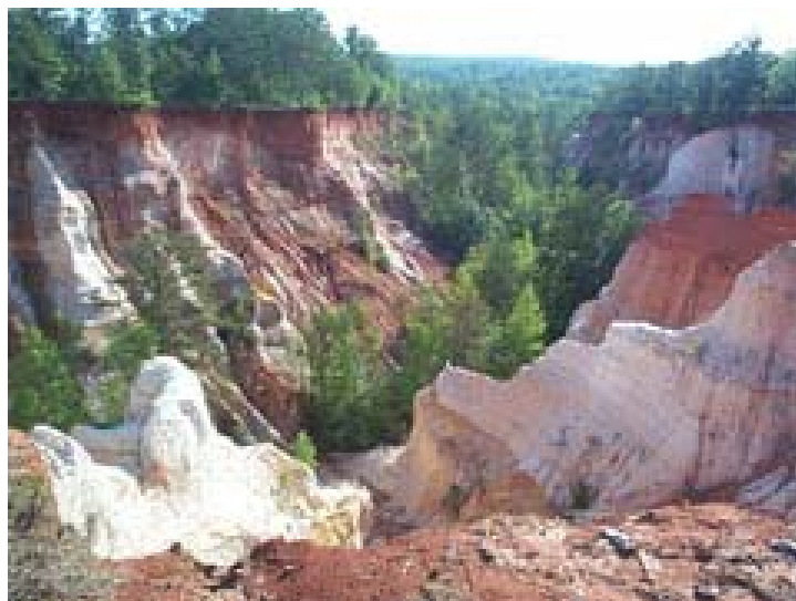
Providence Canyon. This only a small part of it.

The Atlanta Astronomy Club Inc. , the South's largest and oldest astronomical society, meets at 8:00 p.m. on the third Friday of each month at Emory University's White Hall or occasionally at other locations. Membership is open to all. Membership fees are $30 for a family or single person membership . College Students membership fee is $15 . These fees are for a one year membership.