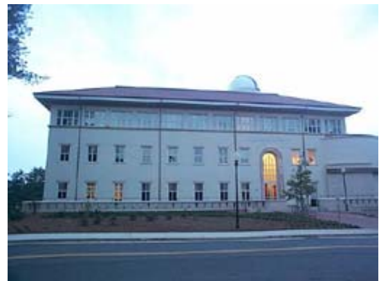
Emory Observatory aka the Math and Science Building.

This month the meeting will take place on the Emory University Campus in the Math and Science Building. The Math and Science Building located across the street from our usual meeting place of White Hall. Street access is via North Decatur Road. Take North Decatur to Dowman Drive (5 way intersection). Turn onto Dowman Drive and Emory Observatory/Math and Science Building is the second building on left side of road. Note that Dowman Drive changes names to Dickey Drive but still same road. Parking is available along Dowman Drive and a parking lot is located behind the Admissions Building. Access is via first left after turning onto Dowman Drive from North Decatur Road.