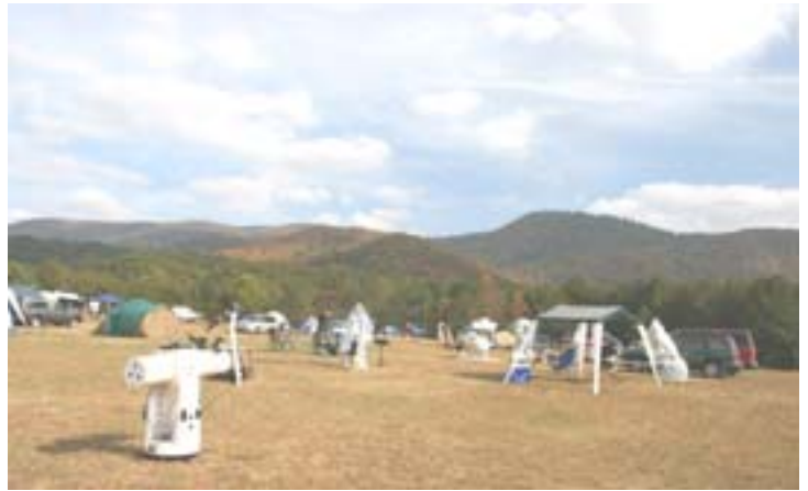
A view of the observing field at Whitewater Express. Volunteers used lime powder and orange traffic cones to designate driving areas. The field was surrounded by forested hills, and a few of the trees were starting to change color for the fall.