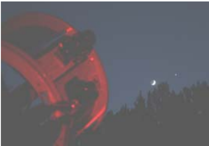
The Moon and Venus set over the observing field on the last night of the Star Gaze.