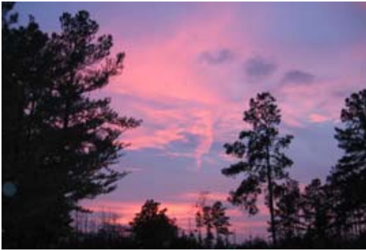
Friday evening's colorful sunset was one of many beautiful views of the sky.