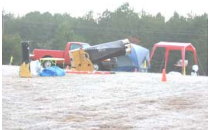
No, that's not snow - just a heavy frost that enveloped the field on Thursday morning. The temperature that morning dipped to 26 degrees Fahrenheit but reached the upper 50s by afternoon.