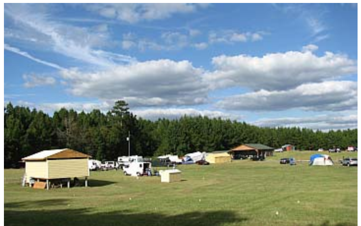
The field starting to fill up on Sunday afternoon. The AAC’s new observatory is under construction in the lower left.