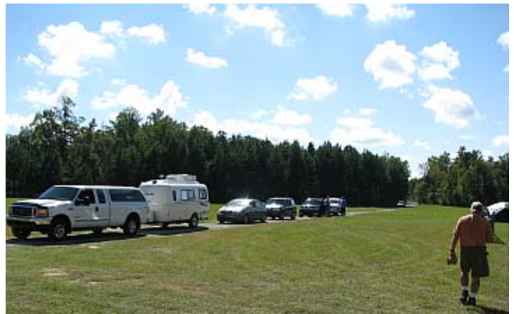
The first arrivals on Sunday lined up around noon to check in.