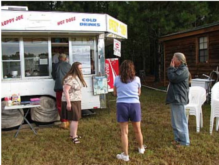
The PSSG Staff got breakfast at Micki’s Kitchen Sunday morning before continuing set up activities in advance of the noon opening.

Here are a few photos from the beginning of the 2013 Peach State Star Gaze - the 20th anniversary Peach State! Check back next month for more photos and reports from the 2013 PSSG!