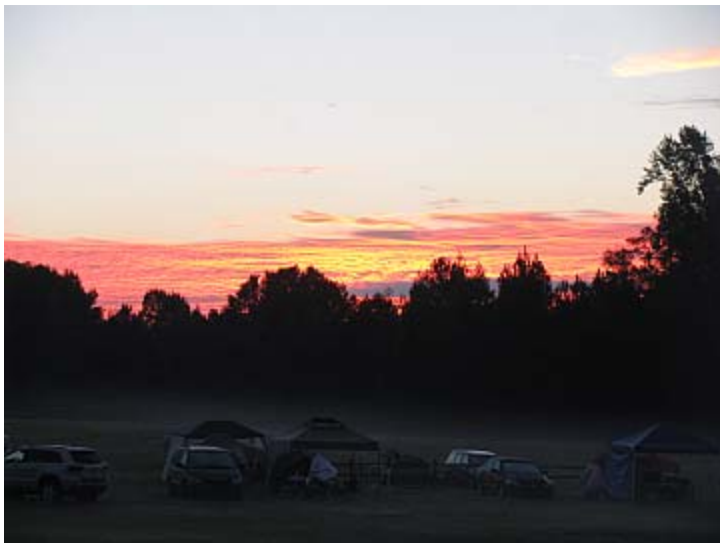
A colorful sunrise on Monday morning greets the first full day of the Peach State. Check back next month for more photos and coverage of the PSSG.